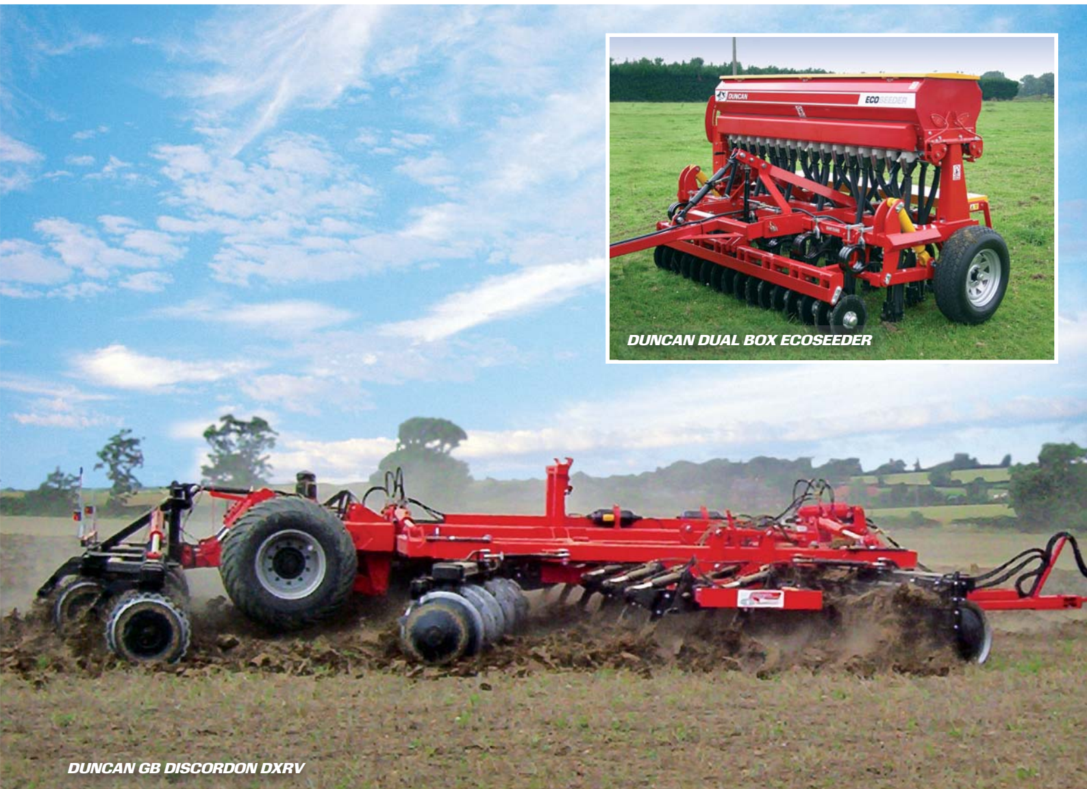
DUNCAN GB DISCORDON DXRV

FEATURE MACHINES: DUNCAN GB DISCORDON DXN11 DUNCAN DUAL BOX ECOSEEDER