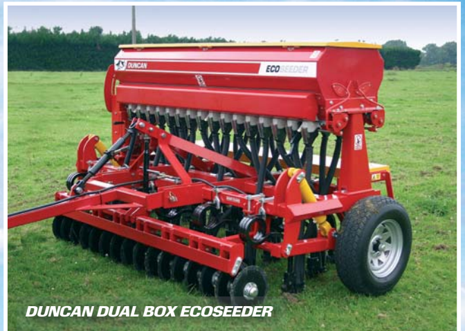
DUNCAN DUAL BOX ECOSEEDER