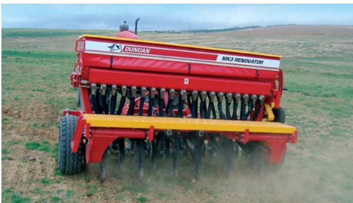
Duncan Renovator MK3 working in South Africa.