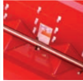
Agitator shaft is standard to help prevent seed compaction and vees for better seed flow