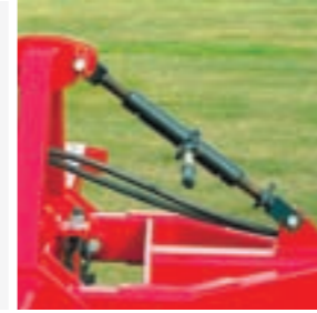
Easy to adjust drawbar pitch with this turnbuckle