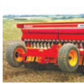
Option of hydraulic rear wheels