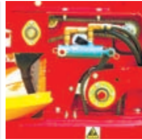
Hydraulically operated clutch for engaging and disengaging the drive