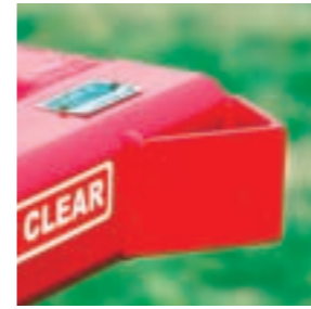
Deflector tabs on end of roller