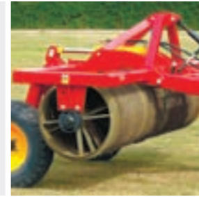
High underbody clearance for transport