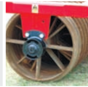
Rubber encased roller bearing and 3" axle