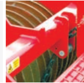
Safety support chain for transport with easy to remove pin