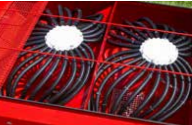
Split hopper with concealed distributor heads