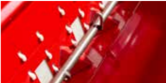
Stainless steel agitator shafts