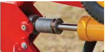
Depth adjustment on the ram