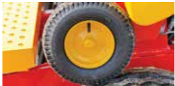
Ground drive wheel