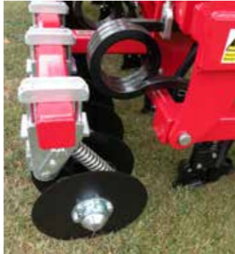
Opening disc & tine/boot/point