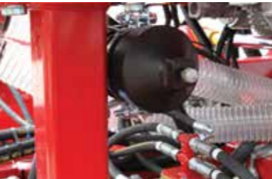
Hydraulic accumulator for holding wing pressure