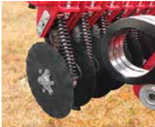
Optional Turbo Tilt opening disc