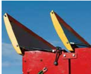
Box lids open to 110°