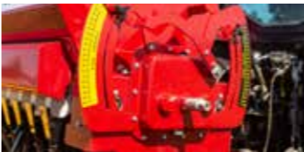
Mechanical drive gearbox