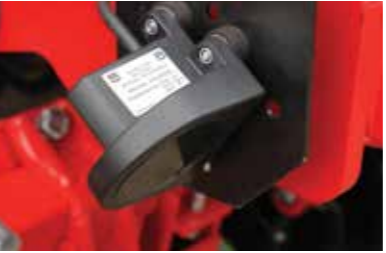
Ground following radar