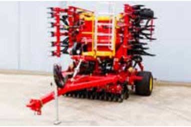
Folded for transport