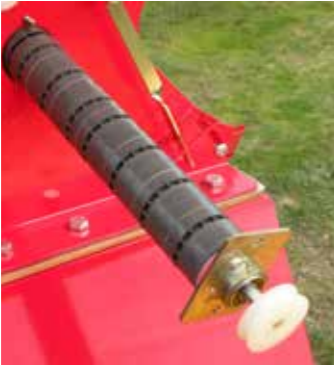
Easily changed metering cartridge