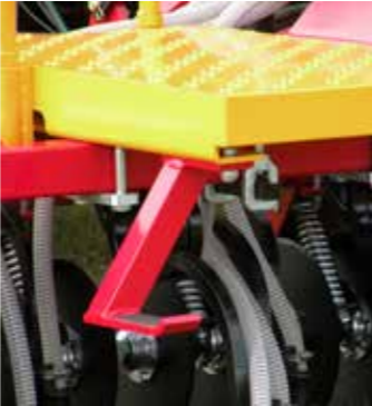
Easy, safe access for loading