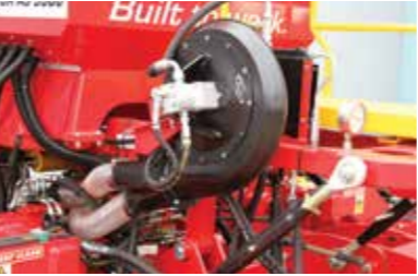
Hydraulic fan with splitter