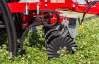
Turbo Tilth disc, tine and boot