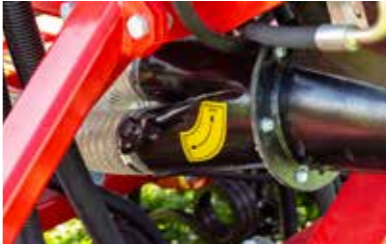
Split airflow, butterfly valve