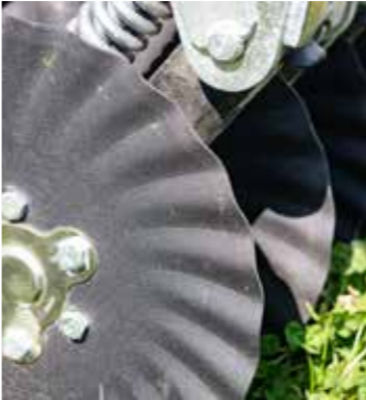
Turbo Tilt opening discs