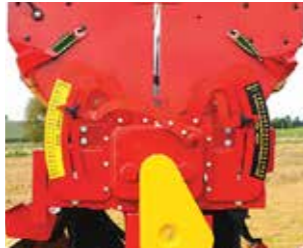
Easy to adjust, variable gearbox