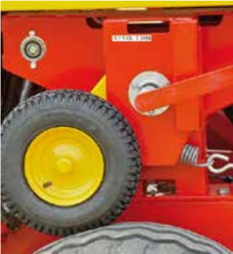
Ground driven jockey wheel