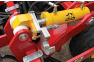
Depth adjustment on rams