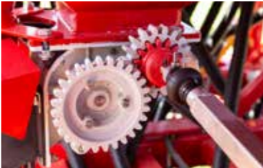
High/low range output settings